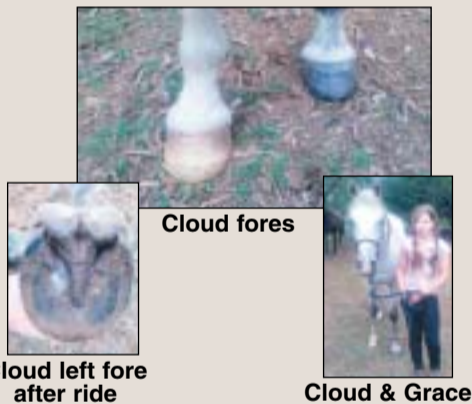
Cloud left fore after ride

Highland Natural Hoofcare - the results say it all - Naturally!